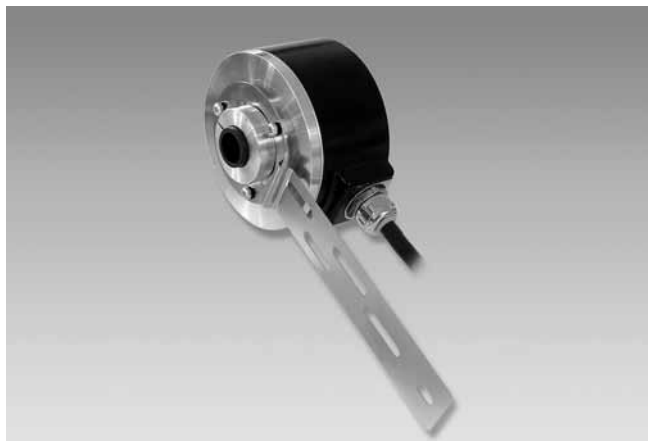
ITD 41 A 4 Y117 with through hollow shaft